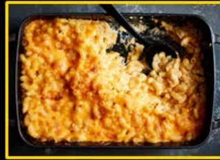
Southern Style Mac & Cheese