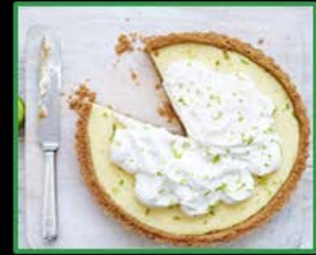
Key Lime Pie