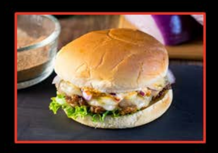
Jerk Pork Burger