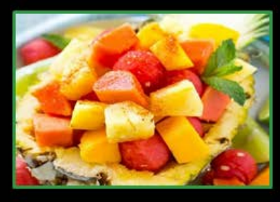
Mango Fruit Cocktail