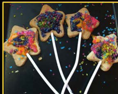
Firework Cookie Pops 50p each