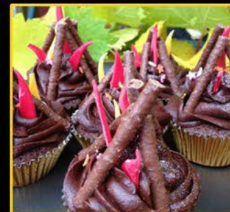
Bonfire Cupcakes 50p each

Follow The Basildon Lower Academy on our social media channels