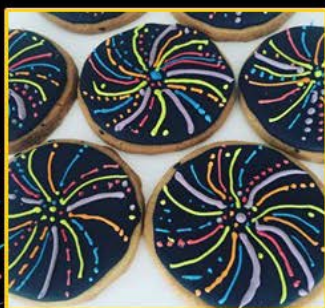
Catherine Wheel Cookies 50p each

To celebrate Guy Fawkes Night the Dining Hall will be serving fireworks themed food at break & lunchtime on Friday 3 rd November